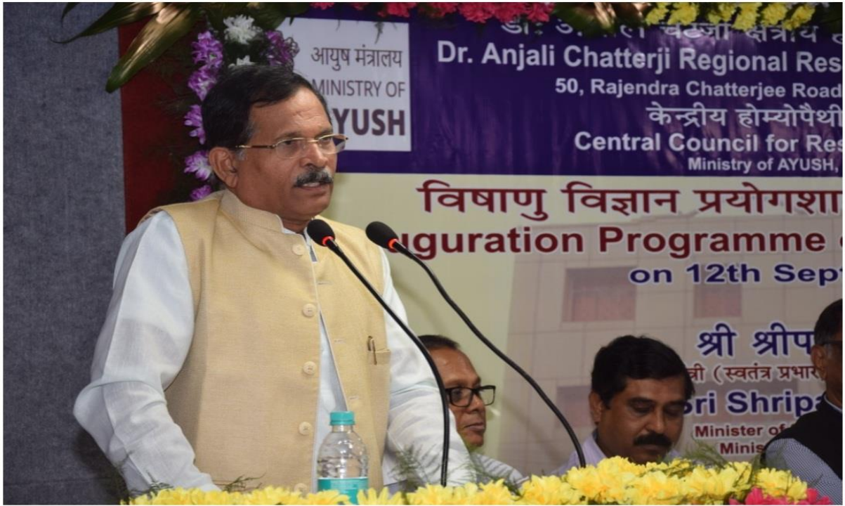
Hon'ble Minister addressing the gathering in the inauguration programme