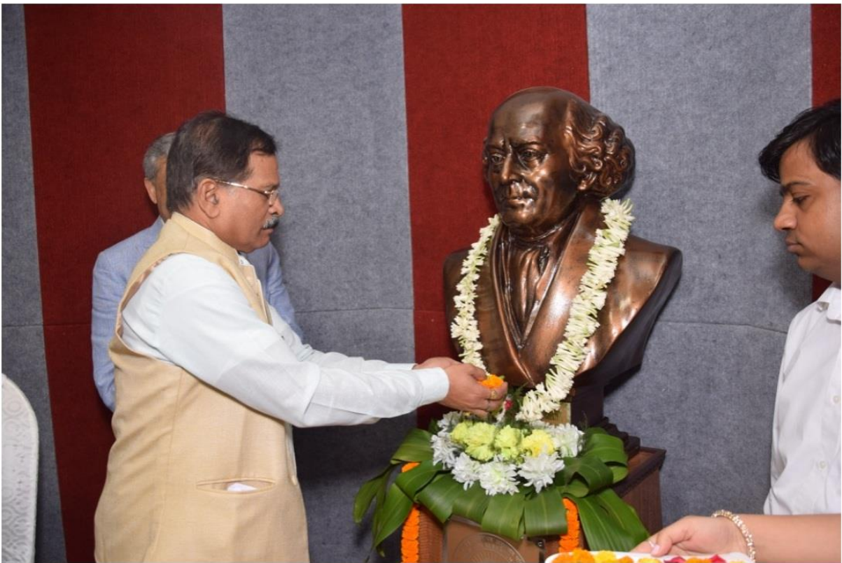
Hon'ble Minister paying floral tribute to Dr. Samuel Hahnemann